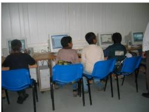
At the moadonit , Bedouin children become computer proficient

educational issues between Israeli and German professionals. Participants included representatives of Israel's Ministry of Education, the Efshar Association, the International Federation of Educative Communities and its Israeli branch, and professors from Erfurt University and Alice Salomon University in Berlin.